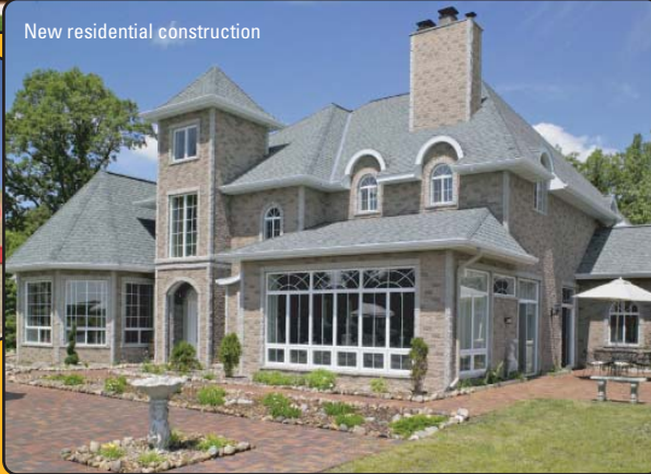
New residential construction