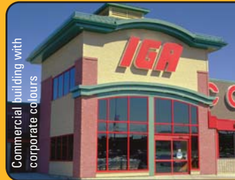
Commercial building with corporate colours

Novabrik requires no brick ledge and can be easily installed on various types of structures and in all weather conditions.