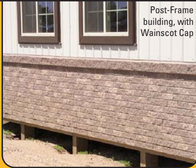
Post-Frame building, with Wainscot Cap