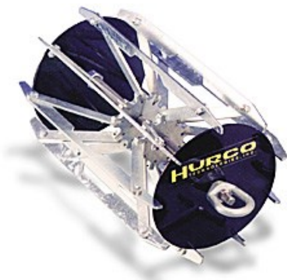
Figure 2: Mandrel, used for deflection testing

The Post-Installation Inspection Guide answers all of the questions above. This guide is a compilation of best practices from AASHTO, American DOT's, and other agencies across the United States. A task group was formed with the sole purpose to improve post installation inspection in America. The task group scoured numerous specifications and best practices in order to produce the guide. The following bullets are from the guide: