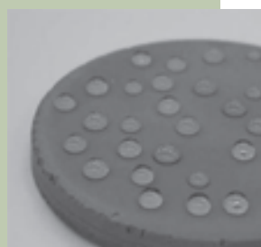
Repelex with Hycrete®